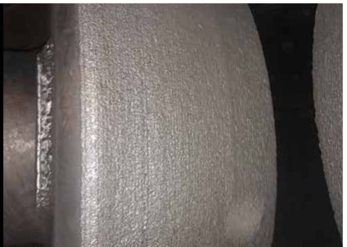
MillCarb™ after 19000hrs grinding

contactus@welding-alloys.com www.welding-alloys.com