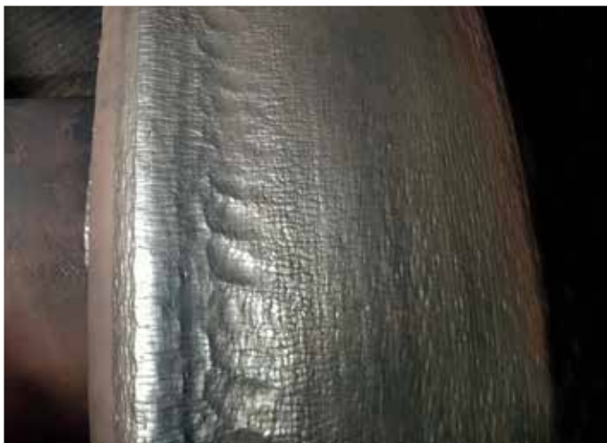
Competitor product after 18000hrs grinding

showed the same wear levels as ceramic embedded rollers experienced at only 190,000 tons in a very abrasive coal grinding environment.