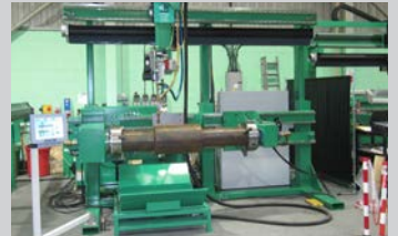
Simple Roll Cladder

H-Frame D-Trak Simple Roll Cladder Internal Pipe Cladder