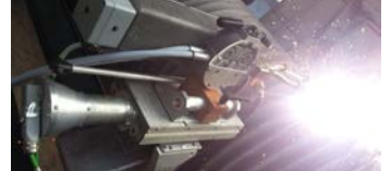
Sugar Mill Kit