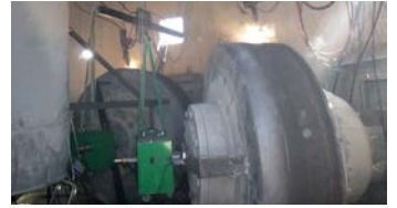
Integra Mill Kit

SMK - Sugar Mill Kit IMK - Integra Mill Kit LMK - Loesche Mill Kit KHD Machine