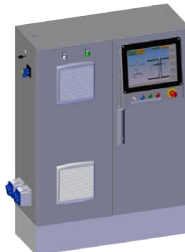
Integrated screen Box